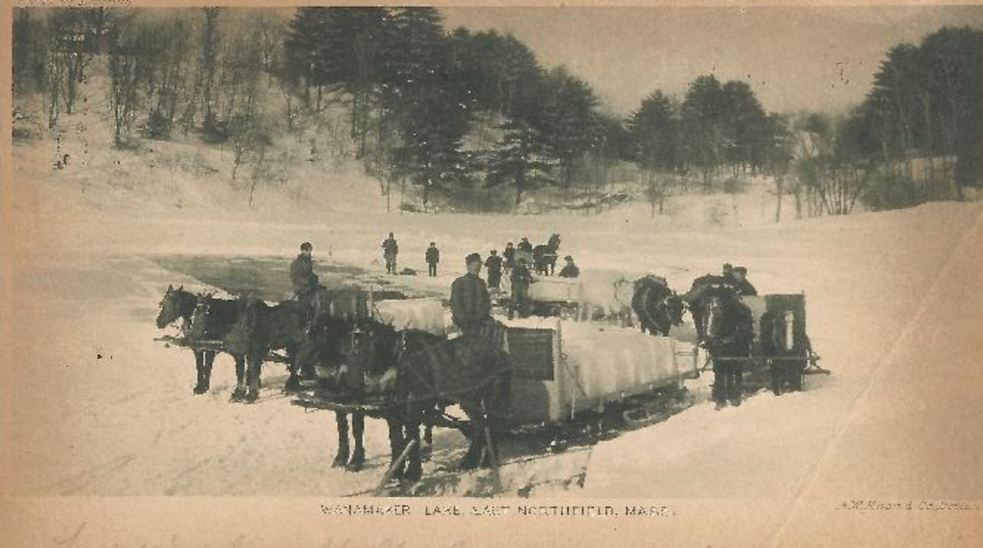
Wanamaker Lake, East Northfield, MA

This is the 20 th program in the Auburn Public Library Public Services Education Series